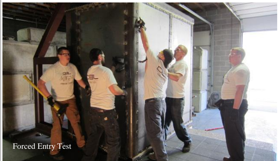
Forced Entry Test